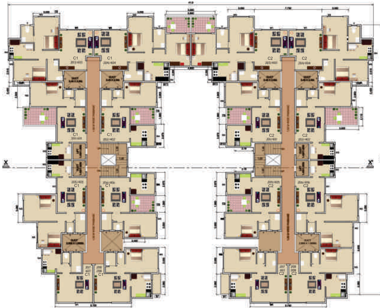
Typical Second & Fourth Floor Plan